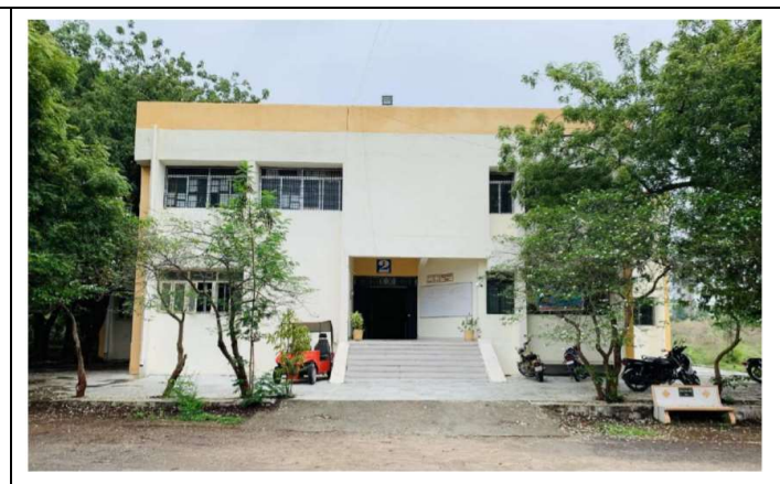
(Mechanical Workshop building)