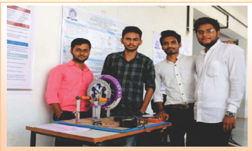
Frictionless magnetic brake