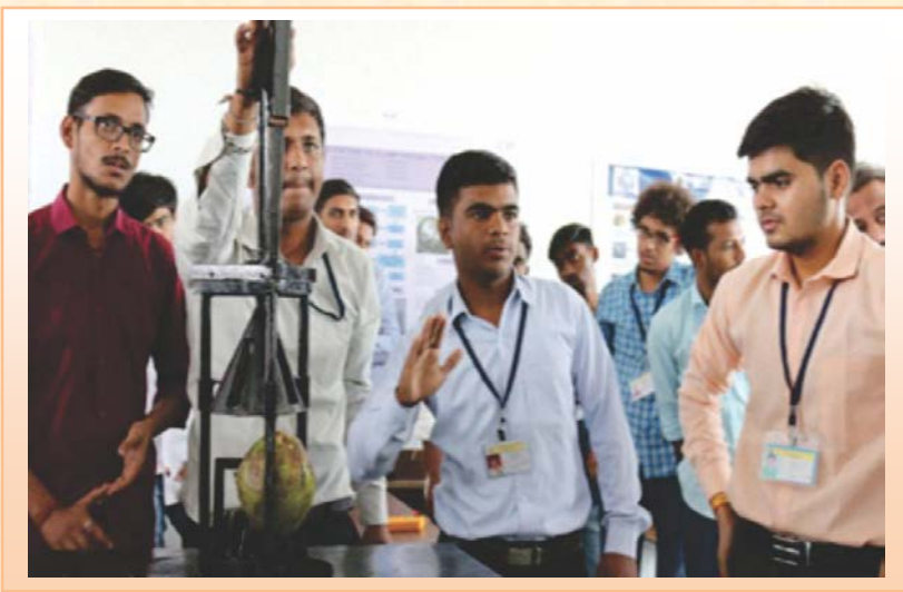
Design of coconut peeling machine

The institute organized a technical event Technothon -2K18 on 13 April, 2018. The intention behind this event was to explore the projects made in way of model/prototype and poster presentation by the students. The final year and non-final year students showcased their projects. It was compulsory for the students of final year to demonstrate their work. For the evaluation of the projects, 2-3 experts were invited in branch. The 1 st , 2 nd and 3 rd winner projects in the final year and non- final year were awarded prize money of Rs.2000, Rs. 1000 and Rs. 500 respectively.