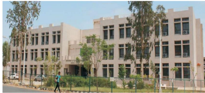
(Electrical Engineering Department)