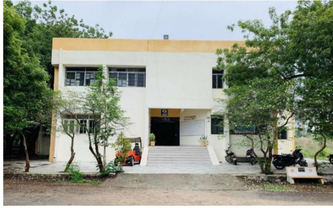
(Mechanical Workshop building)