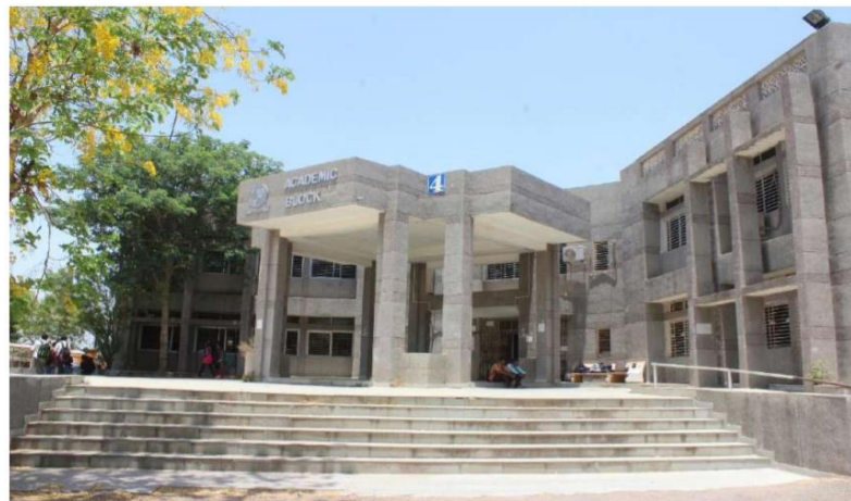
(Electronics & Communication Engineering Department)