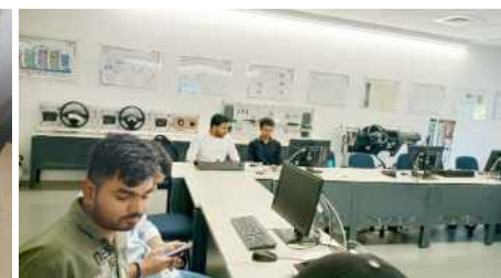
Training at International Automobile Centre of excellence (iACE), Gandhinagar on different topic like Electrical vehicle and Hybrid vehicle, Autotronics, painting technology, welding technology etc.